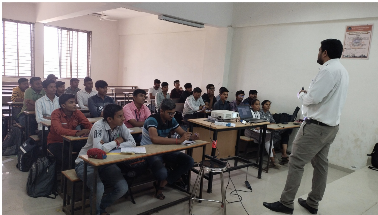
ITERACTION WITH STUDENTS